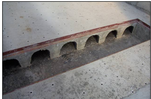
Fig. 2 Detail of the inspection channel