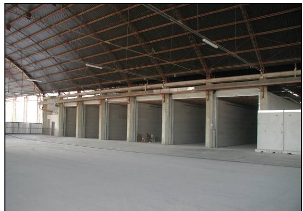
Fig. 4 Completed composting plant

The composting plant treats biomass coming from the food industry waste and water-treatment plant sludges, producing a stabilised fertiliser. The process is of the aerobic type with high load fermentation in closed biocells, followed by ventilated maturing and final refining.