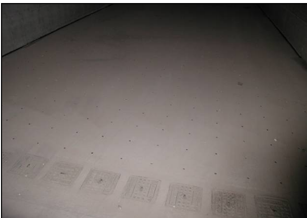
Fig. 3 Finished floor of a biocell